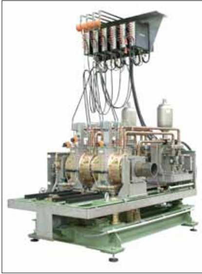
View of the test table with sliding possibility and with two immersion test chambers. The shown system is designed for tube diameters up to 170 mm. Longitudinal defects are detected and the wall thickness is measured. 40 ultrasonic channels are used.