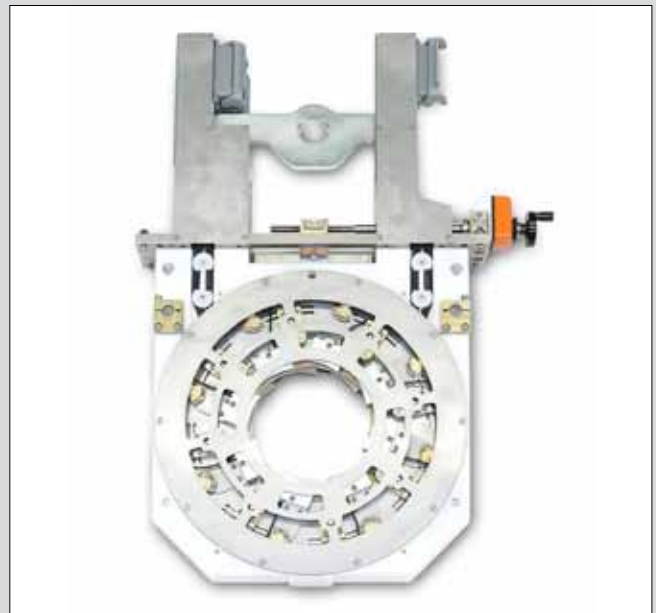
Test cassette with ring of ultrasonic probes and central adjustment of the testing angle by means of the orange dial.