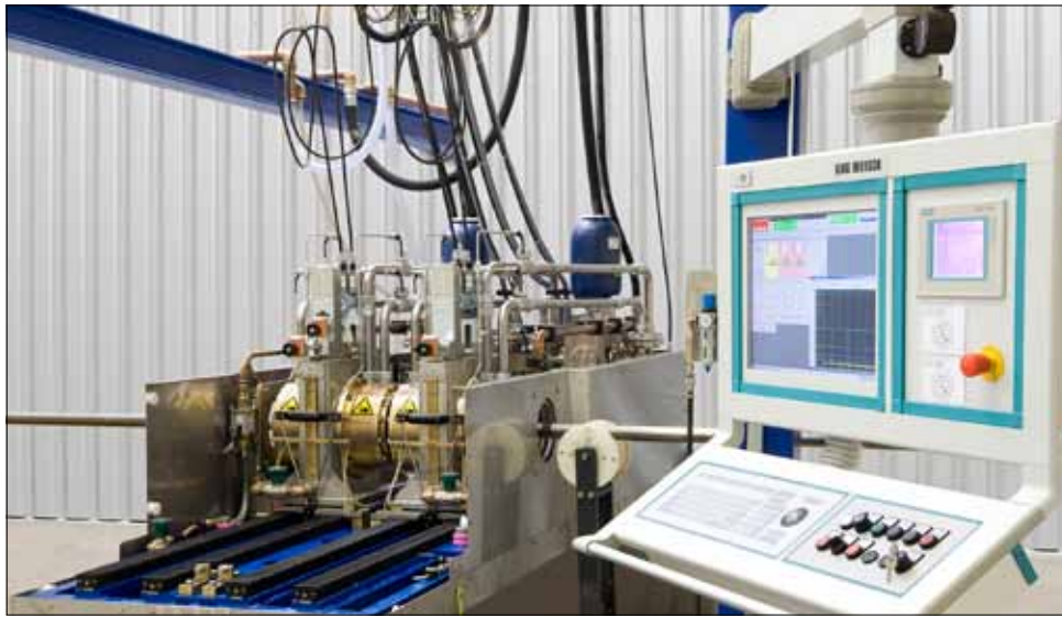
Onsite view of tube testing system (output side)