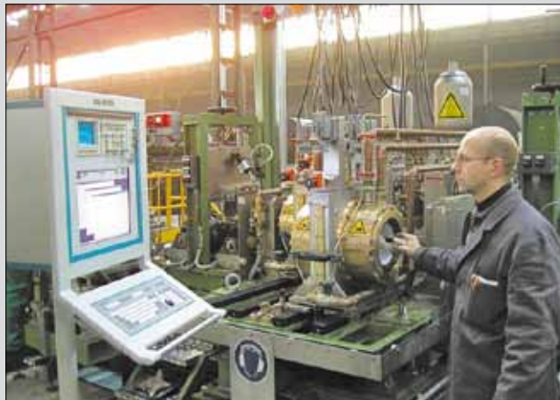
Fast system calibration using the automated sensitivity adjustment, i.e. each probe is adjusted to the same sensitivity.

The closing mechanisms of the testing chambers are designed for tube inspection without plugged ends. Even shorter untested tube ends can be achieved by plugging the tubes or by testing the tubes end by end.