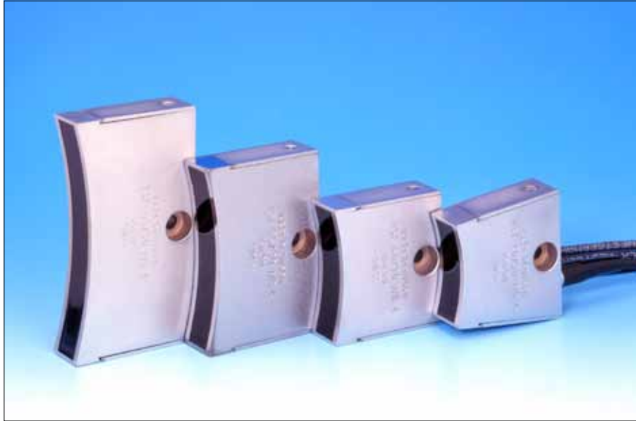
Special line-focussed probes for angular incidence in different sizes to test the respective bar diameters. Each probe covers 30 degree of the bar surface – independent of the bar diameter.